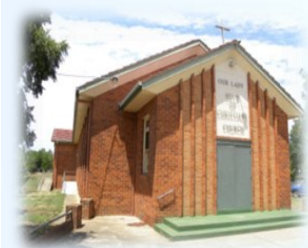
OUR LADY HELP OF CHRISTIANS TANGAMBALANGA