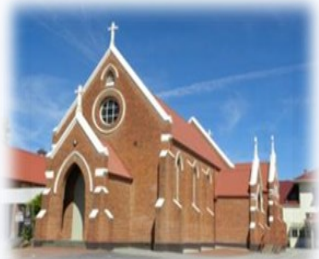
St Augustine's Church Wodonga

WODONGA PARISH CENTRE 283 Beechworth Road Wodonga Vic 3690: Phone: 02 6024 3366 E-mail Address: wodonga@sandhurst.catholic.org.au www.wodongacatholicparish.com.au