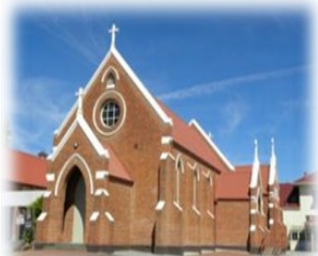
St Augustine's Church Wodonga

Including Bethanga, Dederang, Mt Beauty and Tangambalanga Communities