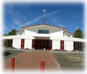
Sacred Heart Church Wodonga