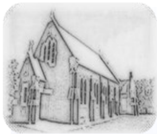
St Joseph's Church Dederang