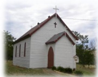
St Francis Church Bethanga

283 Beechworth Road Wodonga Vic 3690: Phone: 02 6024 3366