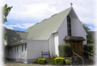
St Joseph's Church Mt Beauty

Including Bethanga, Dederang, Mt Beauty and Tangambalanga Communities