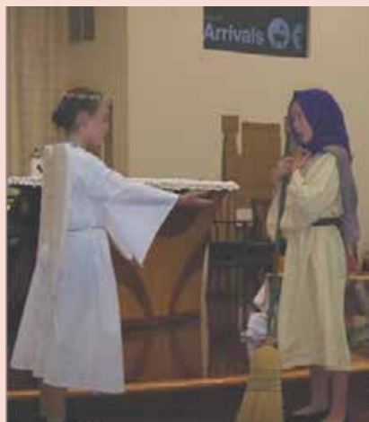
Archangel Gabrielle visiting Mary

This year the youth of our Parish were involved in presenting the readings and the Prayers of the Faithful, delivering the gifts to the altar, being altar