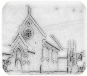
St Augustine's Church Wodonga