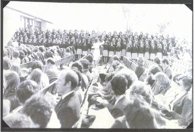
THE CHOIR, 1979