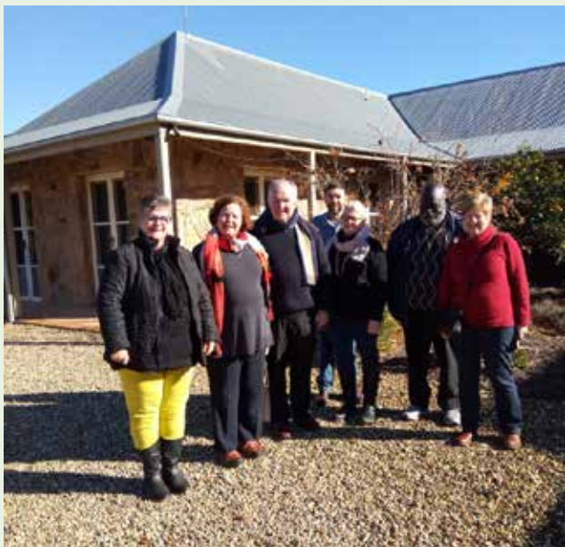
Team 3 on their 2019 retreat