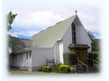
ST JOSEPH'S MT BEAUTY