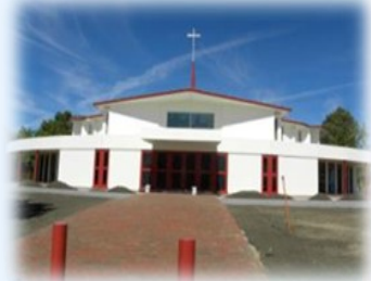
Sacred Heart Church Wodonga