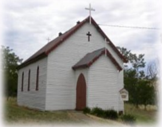
St Francis Church Bethanga