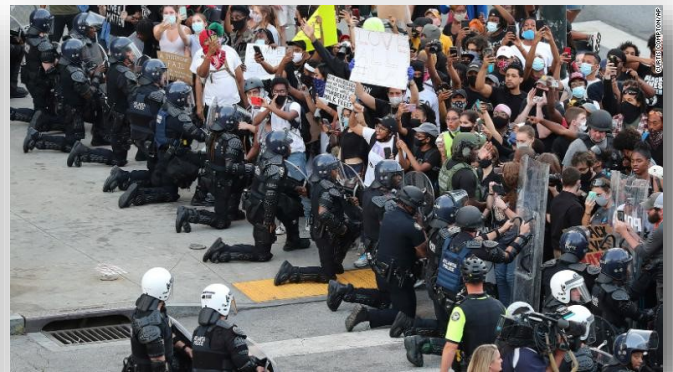
Atlanta officers take a knee before protesters