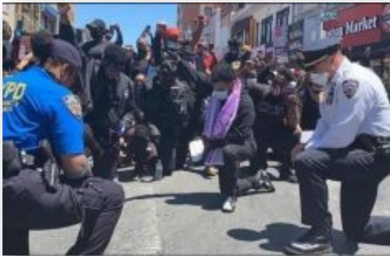
Officers and protesters kneel together in Prayer

“The Spirit himself opens doors and pushes us to press beyond what has already been said and done, beyond the boundaries of a timid and wary faith.”