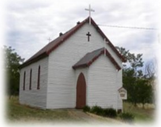
St Francis Church Bethanga