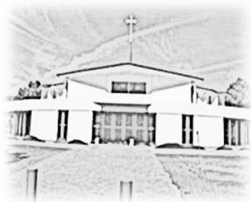
Sacred Heart Church Wodonga