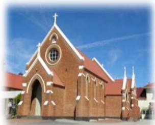
St Augustine's Church Wodonga