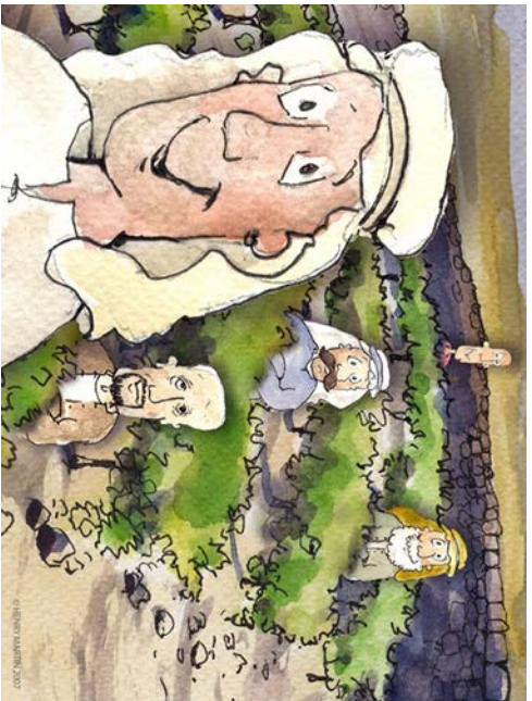
The owner then sent his son to collect the grapes and the wine that belonged to him. But the workers kicked him out and wouldn't give him any.