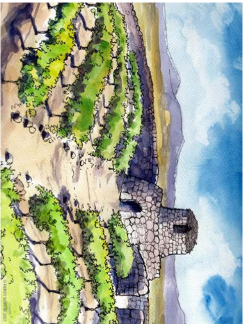
He made a tower and built a wall so that he could make wine.