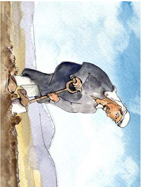
JESUS TOLD THIS STORY. A man planted grape vines.