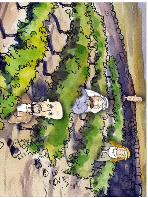
He got people to look after it for him. They grew the grapes and made the wine.