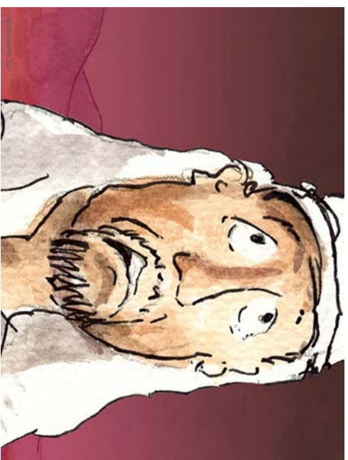
WHEN THE OWNER COMES, WHAT WILL HE DO? Finish the story...