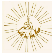
The original school logo